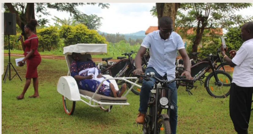
photo of a woman being transported in the Ebike Ambulance

This project has progressively offered a solution to the increasing fuel costs and daily basic needs by providing employment to a number of beneficiaries