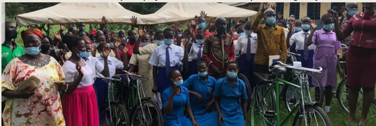
Photo of cycle to school beneficiaries

Increase retention in schools, improve performance, and reduce dropouts through Bicycles