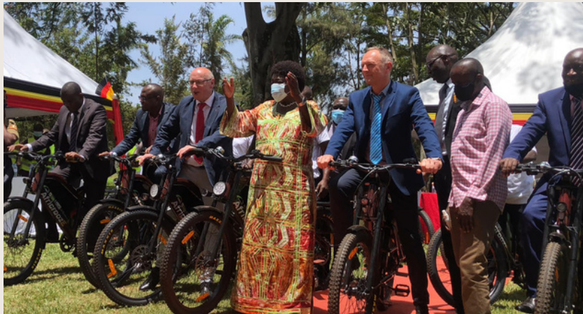
The Grand Ebike Launch