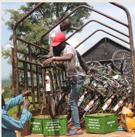
Offloading SHG bicycles

FABIO with the aid of trained staff assembled a number of bicycles which were handed over to the beneficiaries of the new Self Help Groups. An exuberant atmosphere was witnessed on arrival of the assembled bicycles and other materials which were required for the groups to commence the saving. All groups were ready with leadership and profound laws to govern and ensure success of their groups.