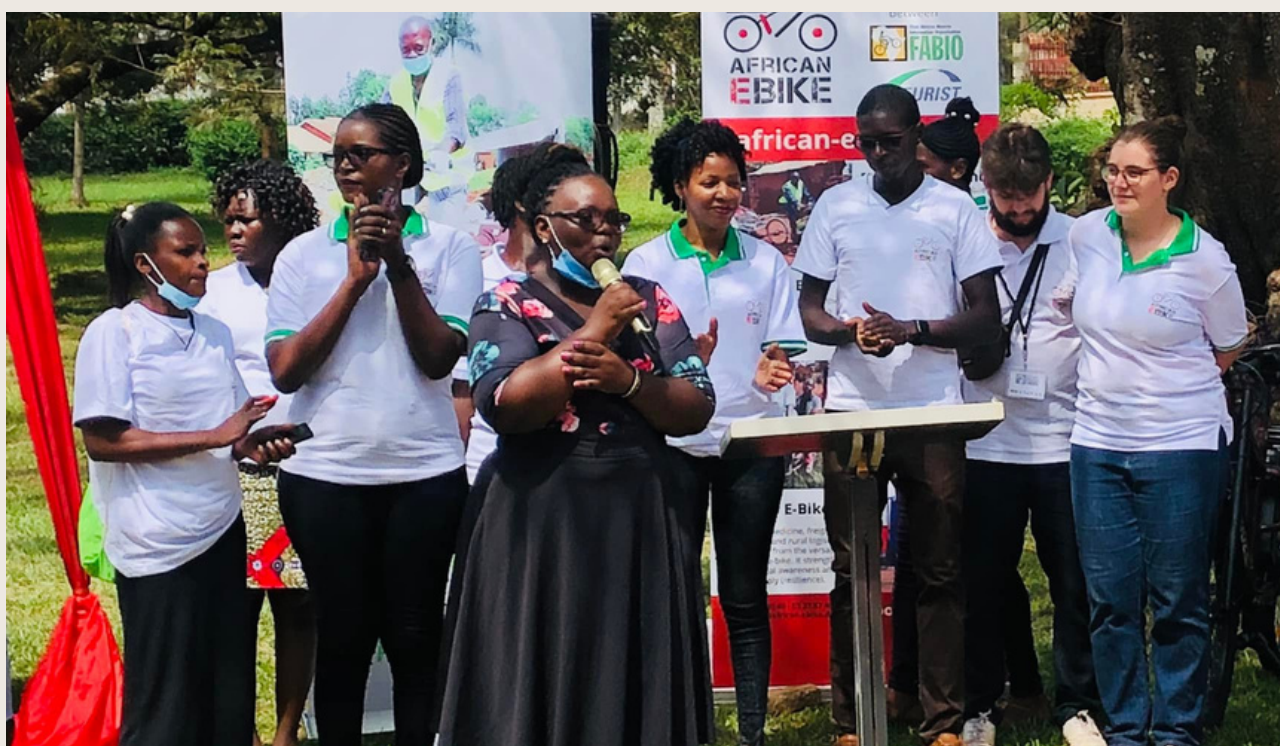
photo of some FABIO staff