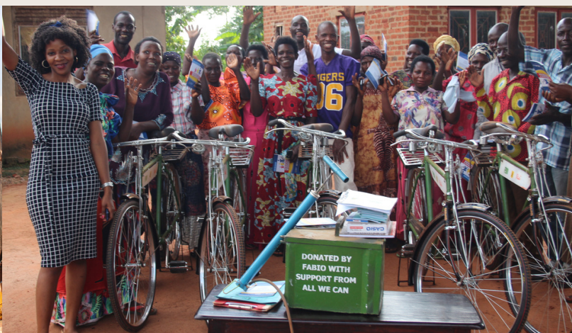
Buwuma East SHG receiving saving materials and bicycles from FABIO