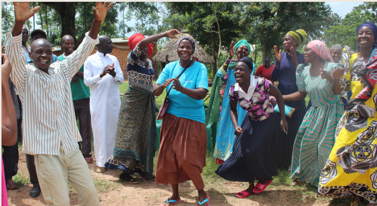
Reaction of members of on of the new SHG groups on arrival of FABIO aid.

FABIO with the aid of trained staff assembled a number of bicycles which were handed over to the beneficiaries of the new Self Help Groups. An exuberant atmosphere was witnessed on arrival of the assembled bicycles and other materials which were required for the groups to commence the saving. All groups were ready with leadership and profound laws to govern and ensure success of their groups.