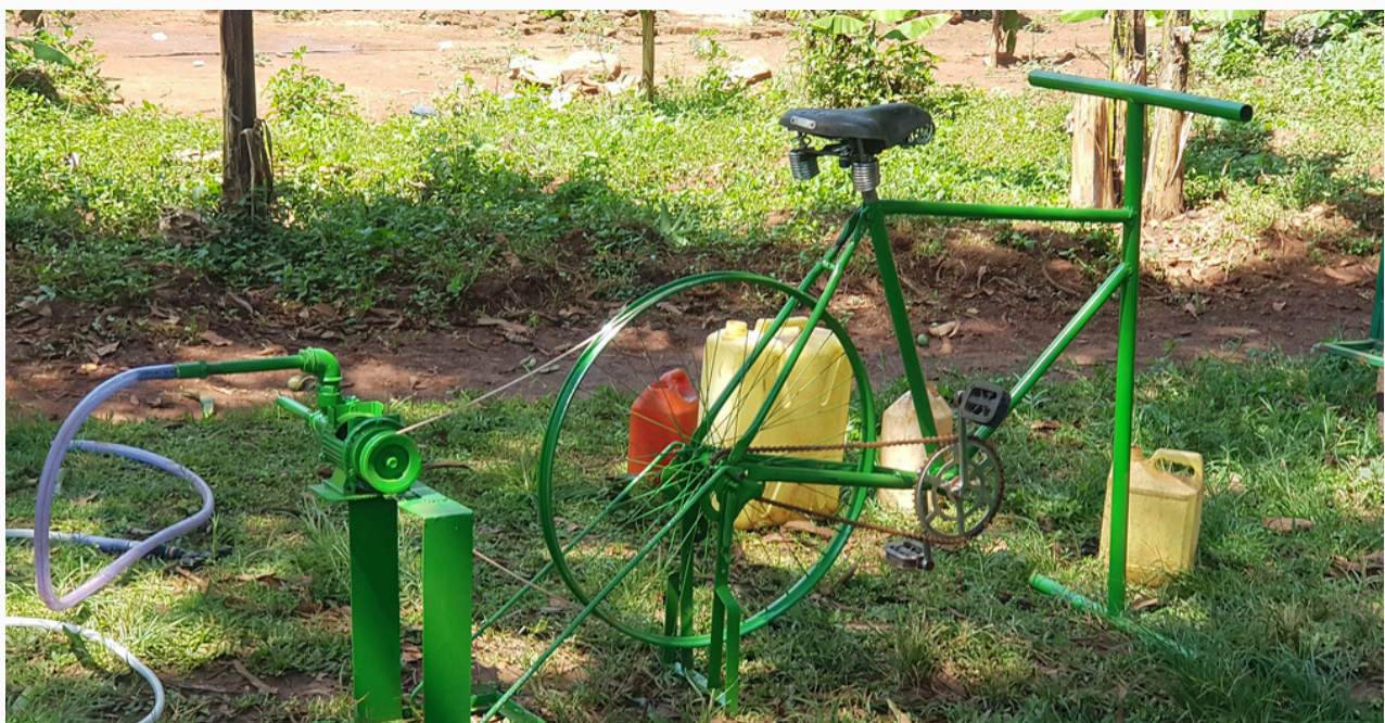
Bicycle for Irrigation.