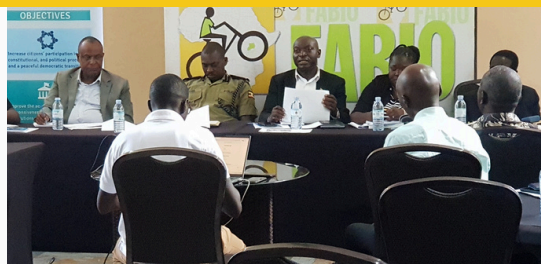
During the District level stakeholder engagement in Jinja.

The community consultations were followed by District level and Regional stakeholders engagements in Iganga, Jinja and Kamuli Districts.