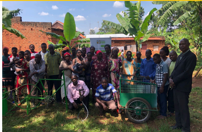
Mayor of Namagera town council and SHG group members receiving the irrigation and Cargo bikes.

FABIO earlier this year, designed two prototypes; a cargo and an irrigation bike. These were delivered to one of the Self Help Groups; Mabira SHG in Butagaya Subcounty, Jinja District. The bicycle designs are to act as prototypes which will guide FABIO on making the communities' best design.