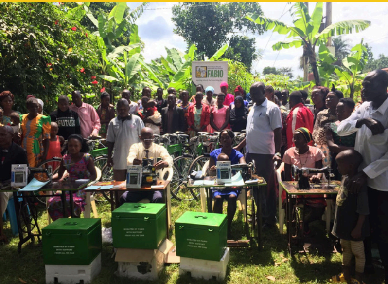
Handover ceremony of bicycles, startup kits for saving and sowing machines to teenage parents under the newly formed Self Help Group in Mabira village, Butagaya subcounty.

Following the baseline survey that was carried out by FABIO in 2022 on the impact of COVID19 to school going children in Busoga region specifically Kamuli and Jinja, it was discovered that many girls between the ages of 14 to 17 had fallen victim of early pregnancies. Most of the parents to these girls had disowned them claiming that early pregnancy is a taboo. The offenders were also not available to support these girls which had left them miserable and hopeless.