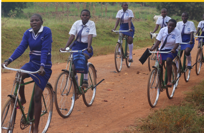
Cycle to School students using the FABIO bicycle

Cycle to School beneficiaries are now very passionate about attending school because of eased access.