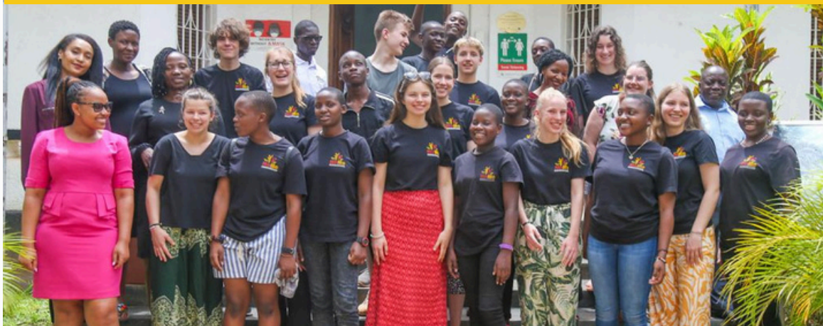
MoMo students at KCCA after a workshop on Kampala's sustainability journey at KCCA

German students under the FABIO-EURIST joint exchange program come to Uganda -Jinja to work together with their Ugandan counterparts on activities oriented towards attaining sustainable cities and human settlement.