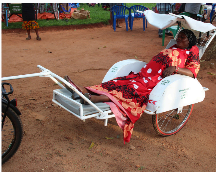
The e-ambulance carrying a pregnant woman to the health center during an emergency.

As narrated by the Village Health Teams, to whom responsibility of these bicycles was given, more lives are being saved due to eased access to health centers