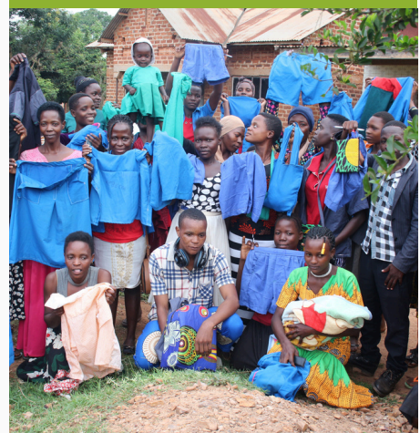
Excited teenage mothers layoff their first products.

FABIO ascertains that with the skills attained from the trainings, beneficiaries can be able to make different products, use the bicycles to access market for their products, save a portion of their income in the Self Help Group, acquire loans with ease to cater for any emergencies, startup income generating activities and also have an increased ability to take care of their lives and those of their families. .