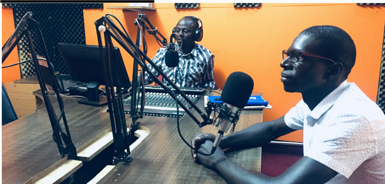
One of FABIO staff during a radio talk show.

FABIO has continued to use different vessels to extend awareness and encouraging sessions to the local populace on a number of topics; the merits of using bicycles, sexual reproductive health, the value of education, safeguarding strategies and good governance among others, with the aim of enhancing a positive mindset amongst citizens, towards education, cycling culture, building a culture of social responsibility and accountability among others.