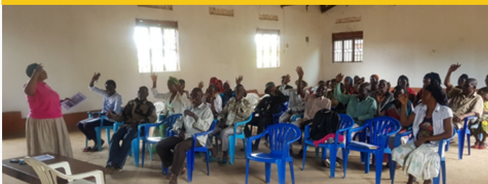
Community consultation meeting in Bulubandi village-Iganga District

Communities and stakeholders contribute to the requisite constitutional, legal and electoral reforms.