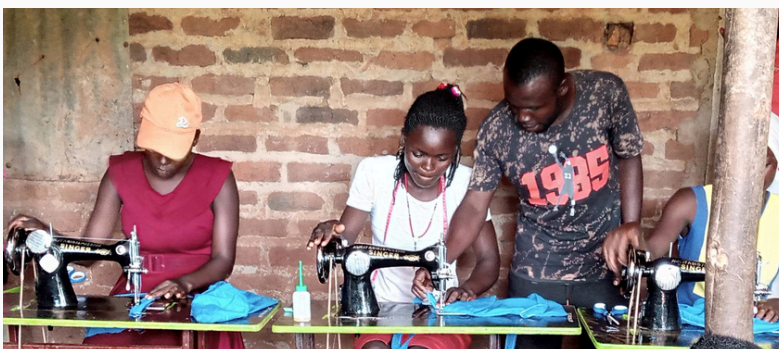
Teenage mothers during a tailoring training.

In the bid to retrieve their lost dignity, hope and talent, FABIO introduced a Self Help Group in Mabira village, Butagaya subcounty- Jinja District amongst 34 teenage parents (32 boys, 4 girls), with the aim of empowering the teenage mothers with different skills especially in saving and tailoring.